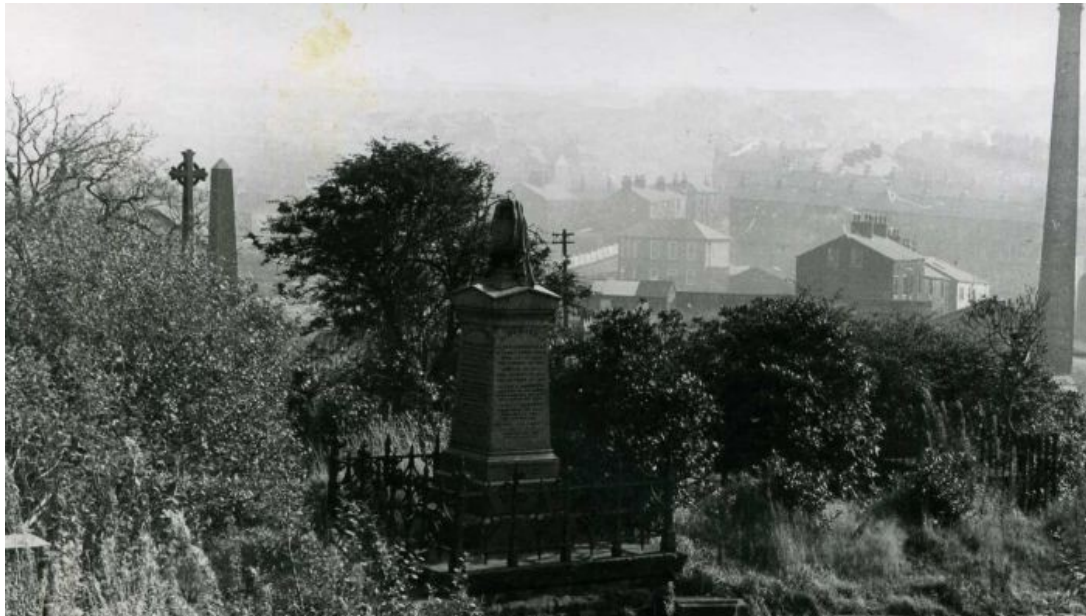
Graveyard of Mount Pleasant after demolition.